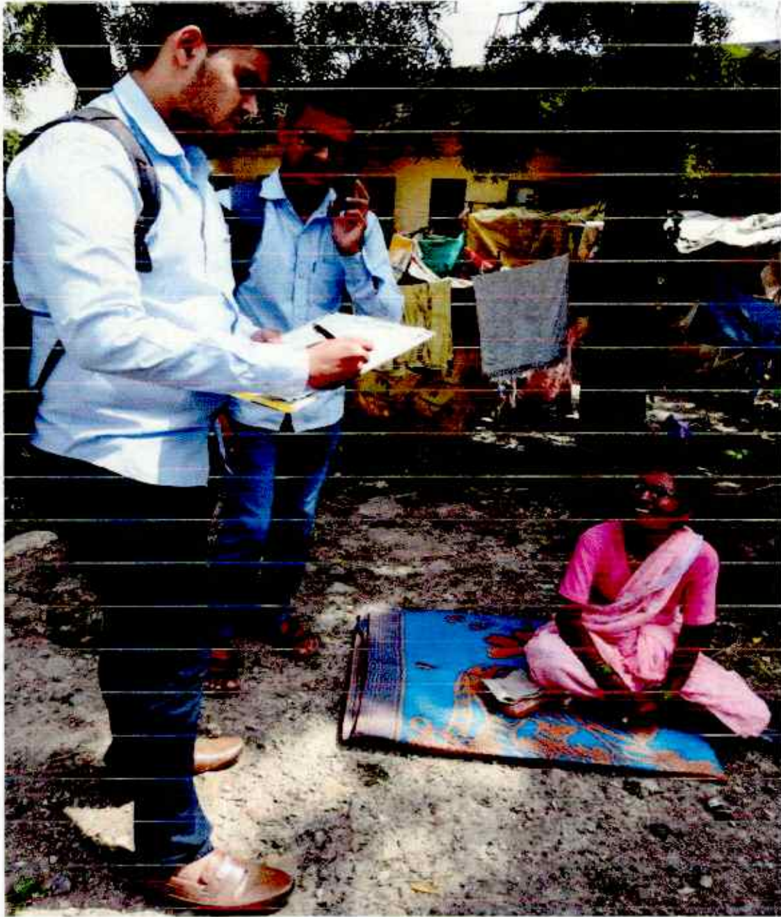
Photos during sanitation survey