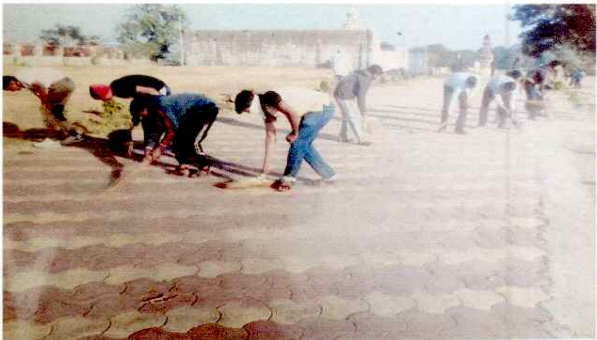
Photos during Cleaning activity in Bhatodi Village