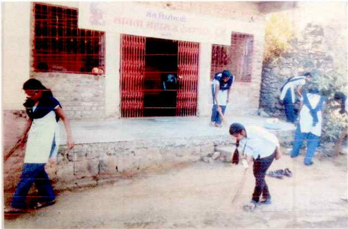
Photos During the cleaning of Bhatodi Village