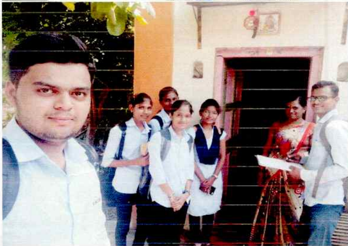
Photos during sanitation survey