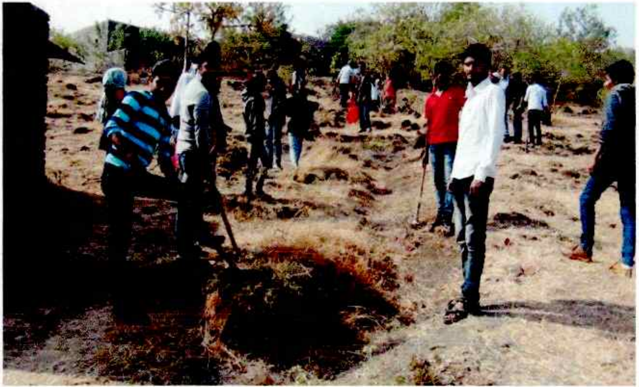
Photo During Cleaning of Sanjivani Gadhi