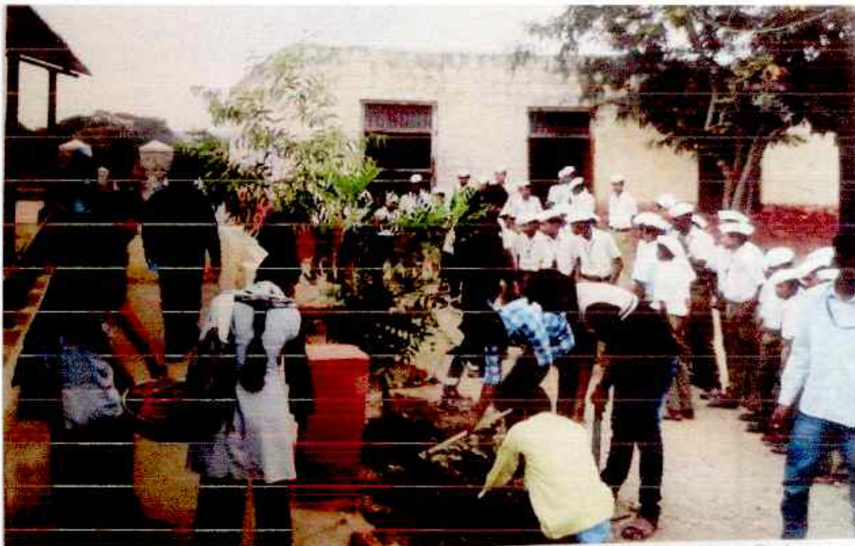
Photos During Tree Plantation

The Tree Plantation and Digging for the same was conducted in Bhatodi, Ahmednagar. In this NSS Students have planted 40 Trees of Mango, coconut, Rose Flower etc @ Bhatodi village & photos of the activity have been generated and attached. NSS students actively performed the event and contributed to the green revolution.