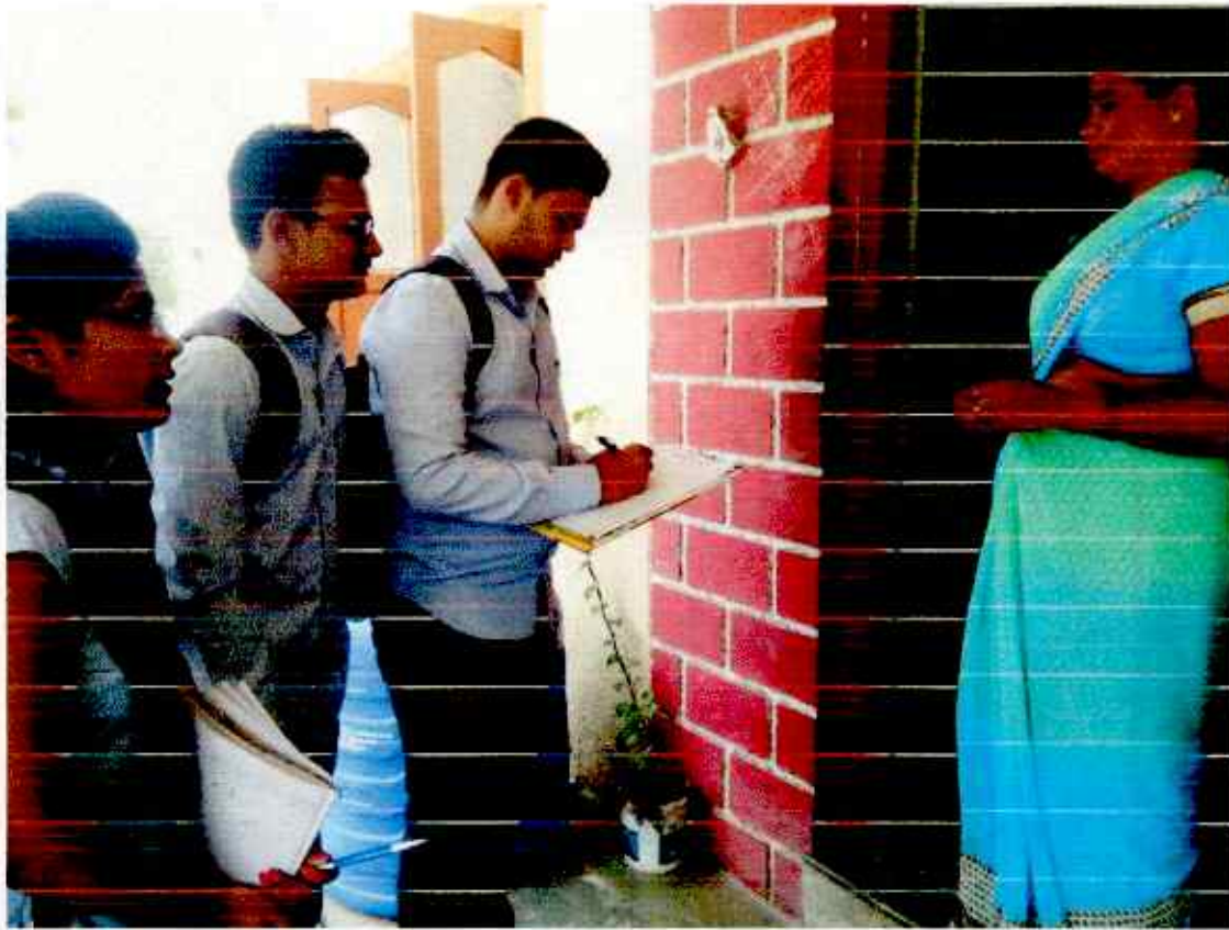
Photos during sanitation survey