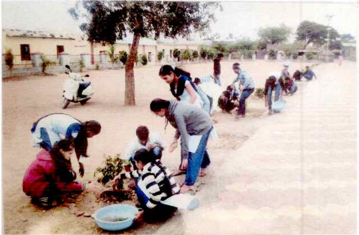
Photos During Tree Plantation