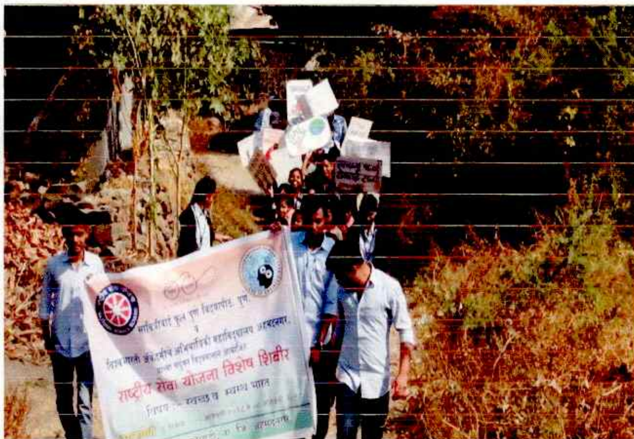
Photos during Rally